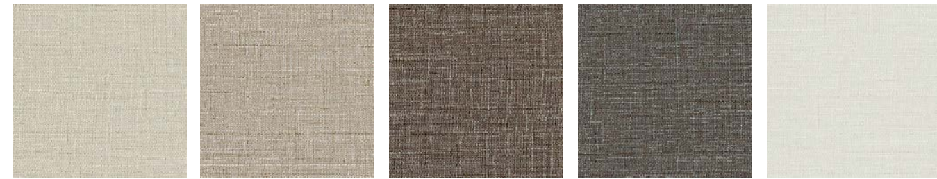
DN2-ELS-22 Rockport DN2-ELS-23 Earl Grey DN2-ELS-24 Bombay DN2-ELS-25 City Storm DN2-ELS-26 Soft White