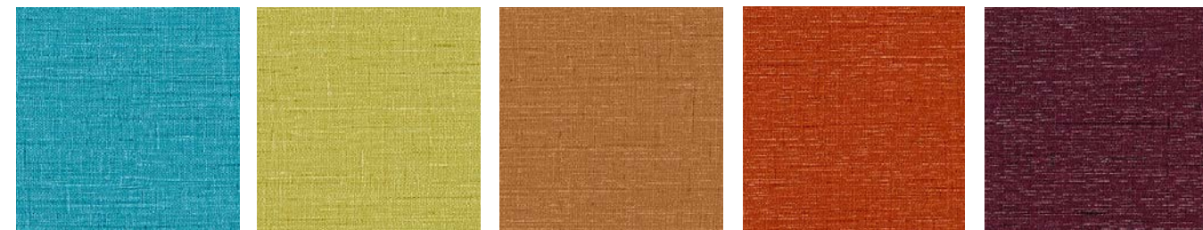
DN2-ELS-32 Cayman DN2-ELS-33 Lemonata DN2-ELS-34 Lantana DN2-ELS-35 Dragon Fire DN2-ELS-36 Fig