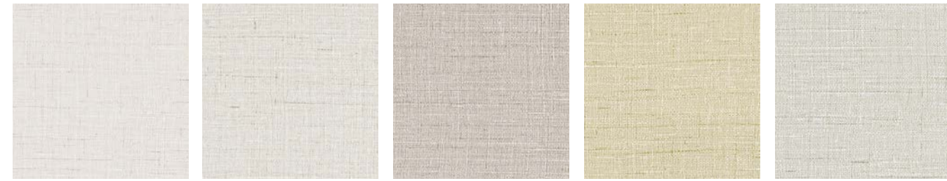
DN2-ELS-07 Canvas DN2-ELS-08 Sand DN2-ELS-10 Pongee DN2-ELS-20 Irish Linen DN2-ELS-21 Sail Cloth