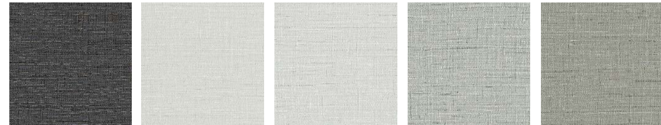
DN2-ELS-27 Hematite DN2-ELS-28 Veil DN2-ELS-29 Shaker White DN2-ELS-30 Sailor DN2-ELS-31 Grey Area